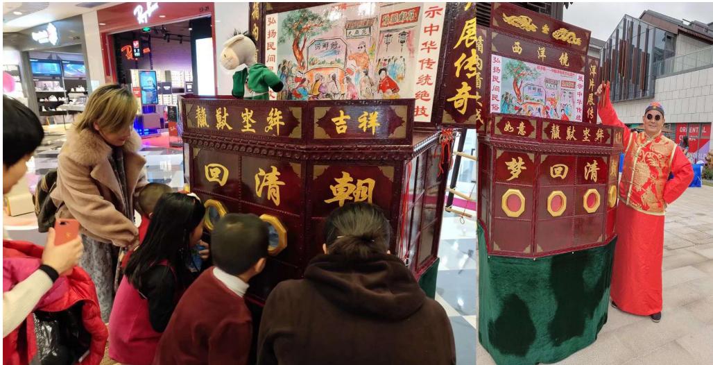
Fig. 2. Modern People Watching Peep Show

“Look inside and see a mass of bobbing heads, it’s heavy snow and yet it’s a cold day; Yang Bailao has sold out tofu and is returning home, holding one kilogram of noodles in his arms; He was preparing to celebrate the New Year, but he didn’t expect that the henchman came to collect the debt before his door; Huang Shiren hounded Yang Bailao to death and snatched Xi’er as his servant girl. “I remember when I was strolling around the Shanghai City God Temple a few years ago, an old entertainer grasped my arm and did not let me go. The passing pedestrians were shocked instantly by this situation. What happened? It was seen there is a big red wooden box with five big eyes painted on it, there were three or five people sitting in front of the big eyes and looked inside intently. There were a lot of audience surrounding the box, and the visitors immediately surrounded the shouting old entertainer’s venue in the busy street tightly. It was seen that the old entertainer was pulling the rope mechanism through the wooden box device while singing, and the sound of gongs and drums behind the wooden box were also heard. It can be said that there are talks and singing, gongs and drums, performances and pictures, plots and stories. There is only one person in the whole performance process, this is the folk art — peepshow (see Fig. 1) .