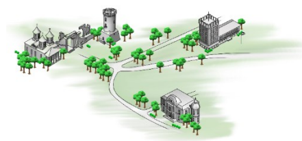
Figure 2: Student activity within the game

When the player explores the virtual world, the background images changes color for the areas the players has visited (Fig. 2).