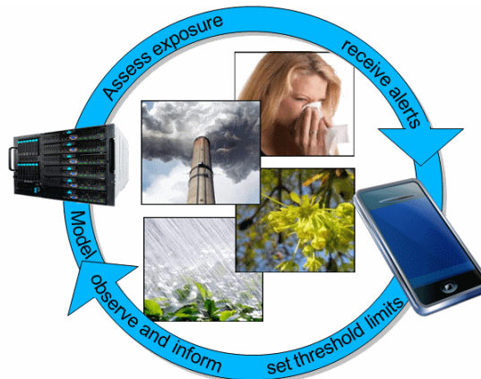
Fig. 1. Desired eEnvironment Services in the air quality domain.

Future eEnvironment services should therefore aid individuals in tailoring information relevant to their specific requirements by providing personalized threshold alerts for air quality, meteorological conditions and pollen, as well as enabling the users to feed data back into the system which will then be used to further enhance the relevancy of the data to the user (Figure 1).