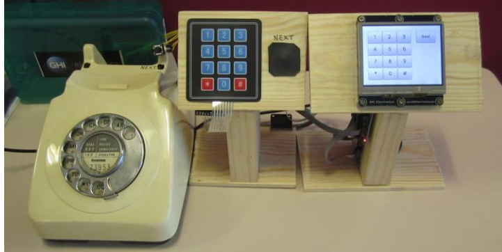
Fig. 2. The three telephone-style interfaces used by participants: the rotary dial (left), pushbutton keypad (middle) and touchscreen keypad (right).

-teen the three interfaces, as a visual display would not have been used on older interfaces.