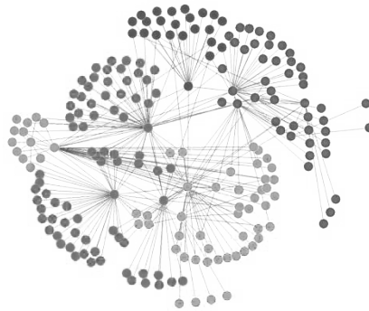
Fig. 2. Scale Free network: Small number of nodes with high degree and a large number of nodes with low degree

Scale free structure: The degree distribution shows a scale free structure that is a heterogeneous network topology encompassing a relatively small number of nodes with exceptionally high degree and a very large number of nodes with low degree (figure 2). One remarkable feature of scale-free networks is that they are highly robust against random errors but on the contrary they are highly vulnerable to attacks targeting nodes which serve as hubs in the network. The scale free modeling lays the emphasis on the network dynamics and its main objective is to model the process that underpins the evolution of complex networks since such an approach will lead to the creation of networks with the correct structure [20, 25].