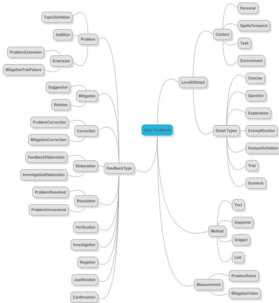
Fig. 2. Forums Analysis Final Thematic Map

This means that a feedback thread may contain multiple problems along with the replies. From the definition of this feedback type as a complex type, this implies that it must contain other feedback types in its definition, which in this case are Confirmation or Negations that must reference another problem. Therefore, it cannot reference a feedback post that contains Mitigation, because by definition we use this feedback to add a problem to a problem.