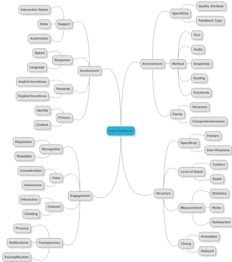
Fig. 1. Focus Groups Final Thematic Map

Engagement refers to the key merits the acquisition process provides to the involved users that encourage them to take part as evaluators. This includes some key characteristics of engaged users with the process, and also the qualities that are important to the process. This includes Recognition, Value, Channel, and Transparency. In details, participants mentioned that they would like to be recognized through their reputation . Reputation may be considered as a component of identity as defined by others. Reputation is a vital factor in any community where trust is important. Also, users would take recommendations, and/or solutions into consideration if they are given from reliable users. The reliability of users increases the weight of their feedback. Moreover, users like to be valued in a way in the participation. Participants mentioned that their feedback is valued by knowing that it