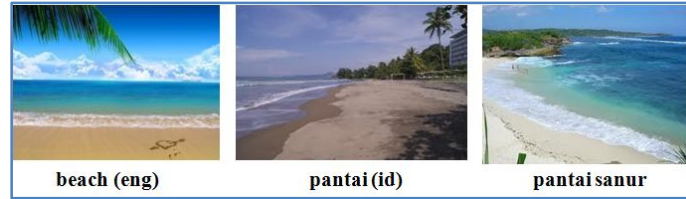
Fig. 1. Image-Language Semantic

Another motivation of this research is the possibility of image-language semantic, which based on the idea of finding semantically related text in visually-similar images. This idea offers alternative way of exploring relationship among term's meaning across languages that could be used to build thesaurus, dictionaries, question answering modules etc. The argument is that similar images might contain text caption that is possibly related. For instance if we can recognize the similarity among images in Figure 1, then we might draw inferences that word 'beach' is related with 'pantai' and 'sanur'. Moreover, with some work on the reasoning part, we also can infer that 'sanur' is a 'beach' and 'pantai' is translation of 'beach' in Indonesian language.