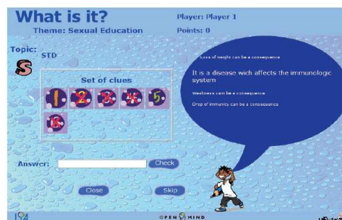
Figure 1: Student interface to the What Is it? sex education game.

We illustrate the potential of our approach by adding cultural support to a sex education quiz game called, What is it? The student's interface is shown in Figure 1. What is it? is a web quiz game where the player sees a topic with an associated secret word. Their task is to guess the word based on a series of clues that are shown one at a time. The objective is to guess the word after seeing the least number of clues. There are ten clues that can be selected by the learners by clicking on a number. The challenge for the teacher is to make a set of secret words and clues that are related to the students' concepts and vocabulary, otherwise, they will be alienated from the concepts being described. For example, many sex education curricula are