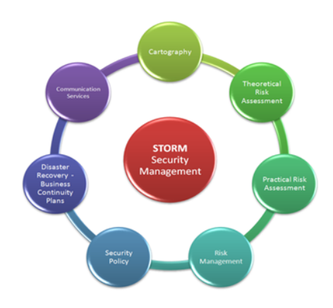
Fig. 2. STORM Security Management Services

perspective (e.g. deficiencies, security incidents, backup procedures, countermeasures of their department). This allows the accumulation of objective information that can be used as input for the execution of the risk analysis and risk management procedures in an effective and efficient manner.