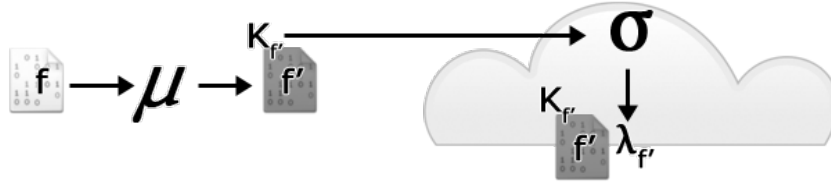
Fig. 2. A visualisation of the notation used to describe the linkability attack. The figure shows how a file is mapped into its internal representation in the storage service by the mapping \mu , and then its storage location is determined by the function \sigma .

\mu_2(f) = (\kappa_{f'_1}, f'_1) , where \kappa_{f'_1} \neq \kappa_{f'_2} and f'_1 \neq f'_2 . Since the function \sigma determines the storage location, and different files should be stored at different locations, then \sigma(\kappa_{f'_1}) \neq \sigma(\kappa_{f'_2}) and deduplication does not occur. So, as a consequence of deduplication, step 1 is always possible within the set of users where deduplication is done. Note that this is independent of whether deduplication is target- or source-based. If cross-user deduplication is enabled by default, this means that all users by default use the same mapping and thus can all perform the first step of the attack. Presumably this is also the case for the service provider, who can simply take the role of a user of its service to learn the mapping.