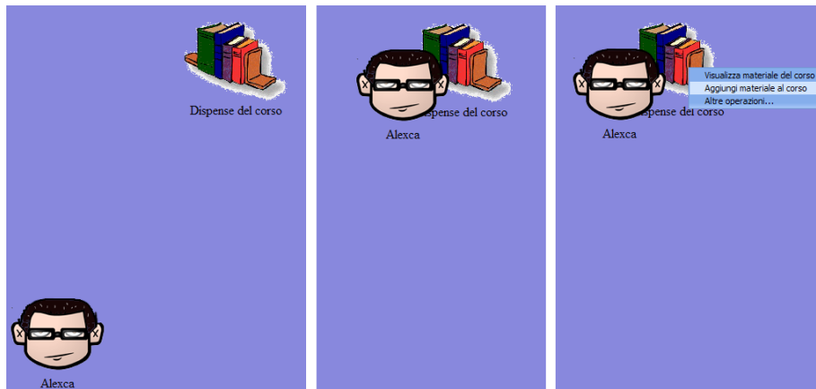
Fig. 1 Example of an interaction between an avatar and course material

For Moodle, as well as for any other LMS, the introduction of a DLS implements a new social networking model. since every user is associated to an avatar, free to move in a web page, interacting with other users and with resources (for instance, opening course material or a real time chat). Logical proximity of activities is naturally mapped into physical proximity of the avatars in the virtual space. The possibility of using a spatial metaphor has proven succesful in the past (e.g. [13])