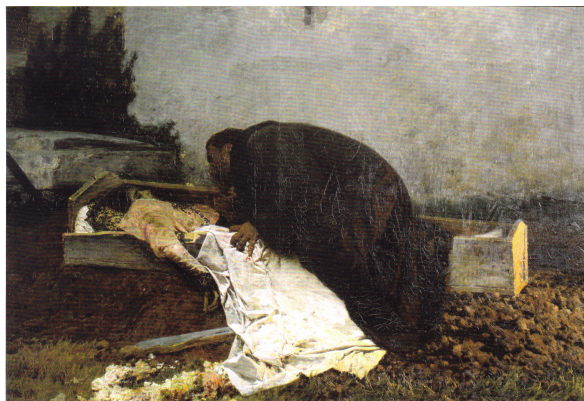
Fig. 1. Hatred by Pietro Pajetta, oil on canvas

Style. The style combines realistic methods with abstracted approaches to underline the topic and to lead the audience's eye to focus on the center of the painting. Even though at first, the painting looks realistically painted, it isn't: The painter carefully focused on the character of the dead woman and added lots of detail to her clothes, especially her white skirt, to make it the most outstanding part of the painting. The second character is almost a mere silhouette, with lack of details. It hovers like an ambiguous shadow over the first character and is nearly as stylized as the nature in the background, which is just implied by its shapes (the trees and the horizon). The level of detail increases with the immediate proximity, while the shapes in the distance appear blurry.