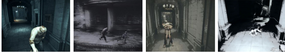
Fig. 5. Visual Contrast during Enemy-Encounter in Haunting Ground

“Examples include flickering lights interjected at specific moments in the game, darkly lit environments or the use of saturated red.” [6]