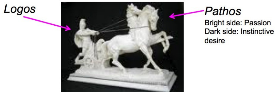
Fig. 2. Logos and pathos.

Here, we recall the ancient Greek origin of Western philosophy. Plato compared the human spirit to a carriage with two horses and one driver in his Republic [2]. Here, as illustrated in Fig. 2, the driver is a metaphor for the rational aspect of the human spirit, called the “logos.” On the other hand, the two horses are a metaphor for the emotional aspect, called the “pathos.” The former could be linked to the formal parts of our lives, and the latter, to the private parts. Furthermore, one of the horses represents passion, while the other represents the instinctive aspect of emotion.