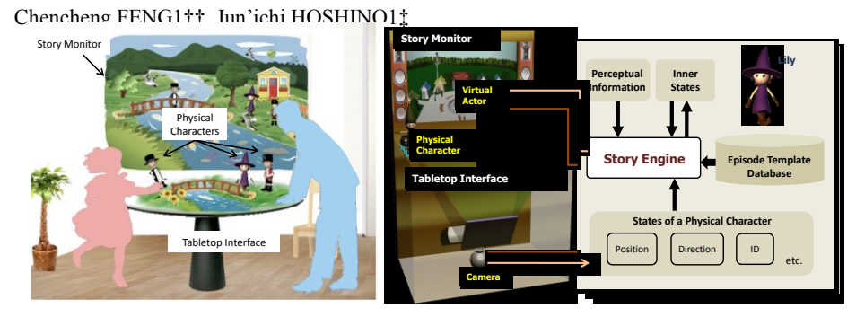
Fig. 1. System Concept Image and System Configuration