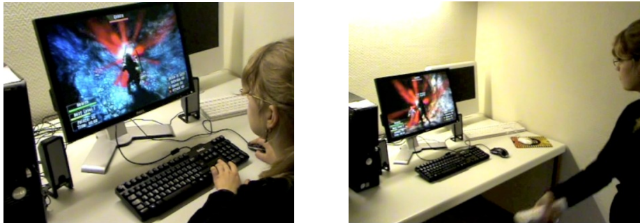
Fig. 2. Playing Wii Remote Dungeon Quest in the Standard Interaction condition using keyboard and mouse ( left ). Using the Wii-Remote ® control in the Gesture condition ( right ) to perform striking movements causes corresponding hits performed by the in-game character.

Up to two participants were tested at the same time. By drawing a slip of paper they assigned themselves either to the Gesture condition or the Standard Interaction condition. They were then told that they would participate in testing a novel game. Neither the violent nature of the game, nor our interest in its effects was mentioned.