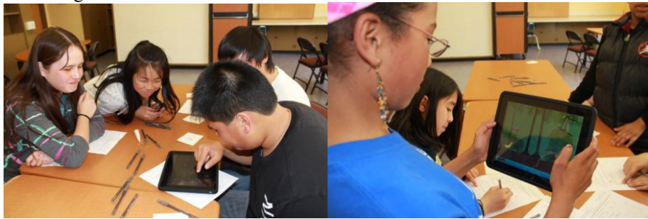
Fig. 4. Photographs from playtesting session at school.

User testing was conducted at a school on 50 students ranging from fourth to eight grade. Students were brought in groups of five and each played a different game on the iPad (see Fig. 4). 72% of the students said they would be interested in redeeming their points online. They also had the opportunity to write a fact that they learned from the game. 67% of students that played the camouflage game (n=12) were able to state a fact that they learned from the game. Example responses to this prompt for all the games include “I learned to make your penguin black or it will be eaten by a shark,” “the bird is the enemy of the butterfly,” and “animals, such as lizards, camouflage themselves.”