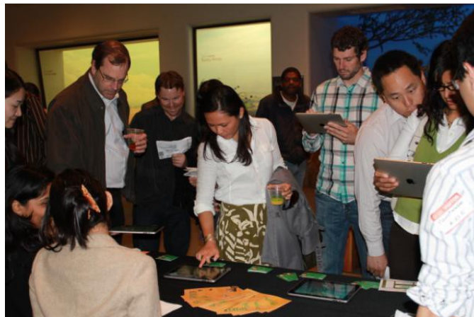
Fig. 5. Photograph from the opening at the California Academy of Sciences

From our opening on April 22, 2010, we had over 300 museum guests play with the iPad games (see Fig. 5). At both the user testing session as well as opening, much of the excitement came from the fact that they were getting to use a new technology. Many museum visitors would play the game based on the sole desire to try out the iPad.