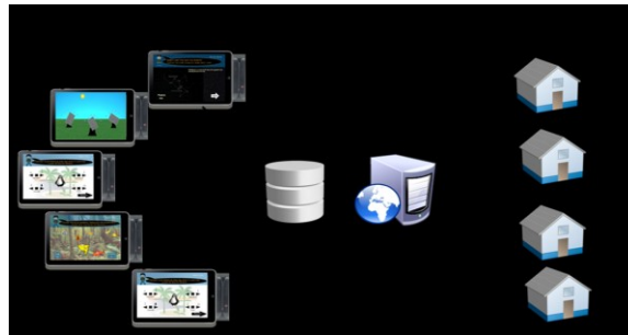
Fig. 1. System architecture connecting data collected from the mini-games in the Academy to the website accessible from home.

The experience begins when museum visitors create profiles on the California Academy of Sciences website. Initially they are able to personalize a limited number of characteristics of their avatars. Once they visit the museum, they play mini-games on iPad kiosks to accumulate points on their accounts. These points can then be redeemed at home by returning to the California Academy of Sciences website. Accessing the website from home allows the user to further personalize an avatar, learn more facts, and compare their scores on the mini-games and their avatar with those of their peers. Points can be redeemed to upgrade the avatar's available attributes and uniforms. The general system architecture can be seen in Fig. 1.