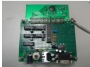
Fig. 1. Keyboard Signal Generation Board

Finally, the board enters the keyboard signal according to the received command into PC.