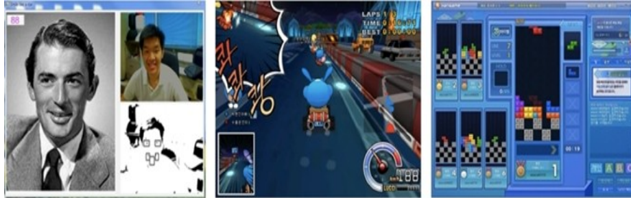
Fig. 3. Games with Face Components Recognition (FCR) Interface (a) Smile like Hollywood star (b) Kart-Rider serviced by NEXON, and (c) Tetris by NHN