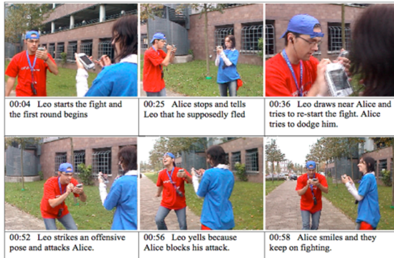
Fig. 3. The German fight

virtual level. The German players fought in an offensive, expressive manner. They pestered each other, and focused on both, the virtual and the real level, compare Table 1.