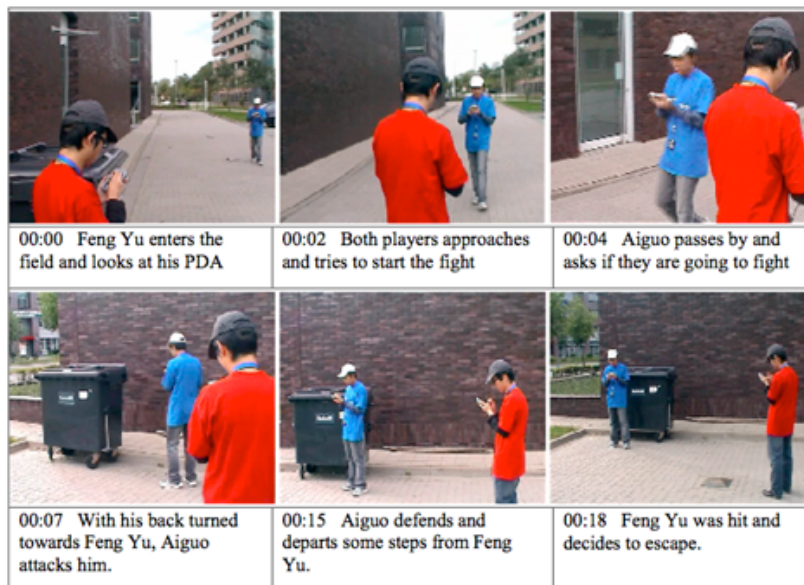
Fig. 2. The Chinese fight

The fight mechanics, a component of the game logic, and of the underlying technology, has been used from both player groups. To conquer a field a player has to move into that field. As soon as an opponent player is within the same field each player has the possibility to decide whether he wants to attack or to flee. To attack the opponent they have to identify their enemy physically and to choose the appropriate virtual symbol of their enemy to start the fight.