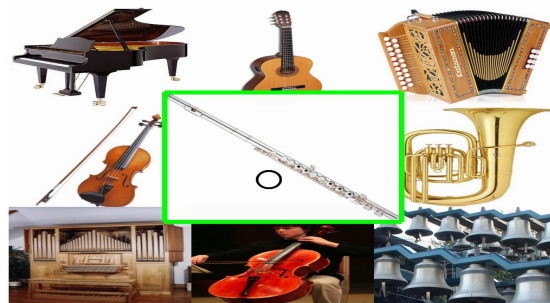
Fig. 1. Instrument choice screen

Interestingly, this feature is at the opposite of what is usually considered as a key gameplay asset in traditional video games; the challenge here is to shrink the choice space while keeping the fun factor as high as possible.