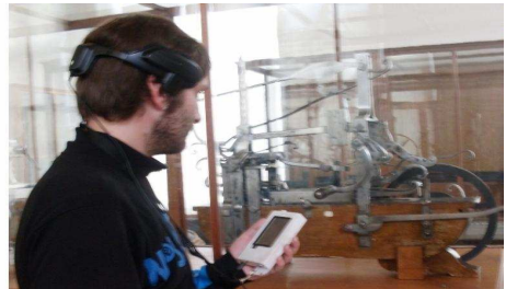
Figure 2: (Left): User holding the PP sensor, looking towards the objects of the real scene; his field of vision is reproduced on the interface. (Right): Experimenting with the PERCIPIO headset at the CNAM museum

After choosing suitable audio samples for our experimentation, the sounds were normalized. The next step was the preparation of the experimentation environment. In a room of 4x4 meters, ten photos corresponding to audio objects were laid out on walls while the same scene was virtually reproduced in the 3D visual interface. The visitor wearing the stereo headset, on which the position and orientation sensor is fixed, is plunged into the immersive environment as soon as the audio objects are activated. His position and orientation is analyzed continuously, while the 3D characteristics of each activated sound are updated following the visitor' movements. When the visitor approaches an image, he can clearly distinguish the associated sounds according to his position and orientation (left or right). The visual field of the visitor is reproduced on the system visualization interface in real time (Figure 2). The latency between the change of user position and orientation and the update of audio content is estimated to 17 ms (milliseconds). This value is largely lower than the human auditory perception duration estimated to 50 ms (milliseconds). In addition, the visitor's head speed motion does not affect at all the auditory performance of the system.