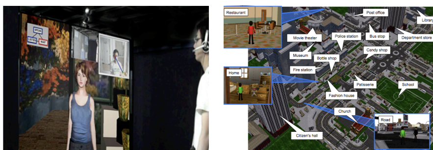
Fig. 1. A snapshot of using second language learning game system and the map of the town. Many daily conversational tasks can be experiences.

In traditional English learning in Japan, learners rarely have the opportunity to practice oral communication, so the acquisition of oral proficiency is a slow process. On the other hand, the task-based learning method enables learners to obtain communicative skills through the practice of particular “missions”. As a result, the efficient improvement of communication skill becomes achievable. In this paper, we propose a task-based second language learning game system. The task-based learning method enables learners to obtain communicative skills through the practice of particular missions using voice and gesture communications with life-size 3D game character.