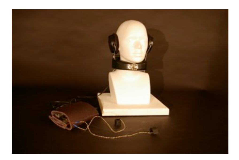
Fig. 2. The final prototype headset

To explore how much the body reacts to scary stimuli, a small test was performed. Several test-subjects were placed in front of a screen and attached to a biofeedback measurement circuit (measuring gsr). On the screen a scene from a recent horrormovie was shown, and the gsr-readings were recorded on a computer. At scary parts in the movie the gsr-reading clearly showed peaks, about three seconds after the actual scary scene. This delay is probably a sum of the lag in sweat building up, and the processing of the sensor-reading. Because the readings gave clear enough results to detect peaks in scariness, the system proved itself robust enough for use in a prototype.