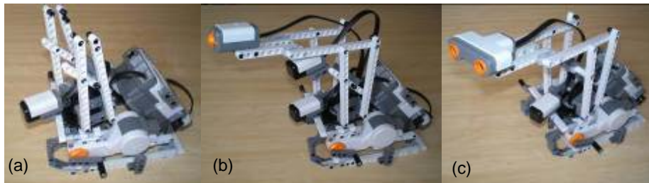
Fig. 3. Reconfiguring a curious robot limb. (a) Lower limb and compass sensor (b) Jointed arm with touch sensor and accelerometer (c) Jointed neck with ultrasonic distance sensor.

The designer then restructures the limb into a jointed neck, as shown in Figure 2(c). The neck can extend and retract and has an ultrasonic distance sensor. In this structure, the robot is curious about extension and retraction of the neck, which cause changes in the distance readings. The robot also develops a somewhat creative behaviour in which it rapidly extends and retracts the neck. The resultant jerking of the structure causes changes in the compass sensor reading, which the agent finds curious.