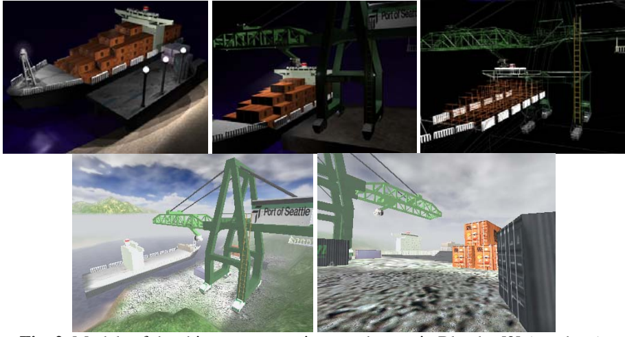
Fig. 2. Models of the ship, cargo containers and crane in Blender [2] (top three). Seaport models viewed in the Torque Game Engine [9] (bottom two).

Another project with similar aims is the L3DGEWorld data visualization tool for network analysis [4]. This project utilizes OpenArena (a derivative of the Quake III Arena game engine) to reflect network activity, and players actions as network commands (such as blocking IP ranges). While the environments differ considerably, both have a similar goal of allowing users to sift through sizable amounts of realworld data via a player. One lesson we take from this project is to abandon realism at times in favor of usability (such as providing a HUD or aerial view upon request).