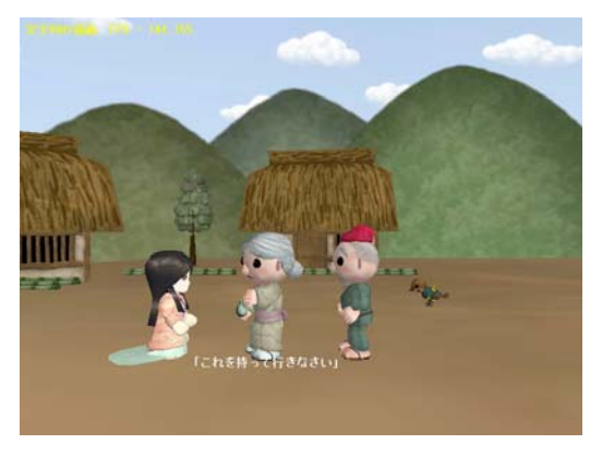
Fig. 5. Example of a story transition

Figure 6 shows several other scenes in this story.