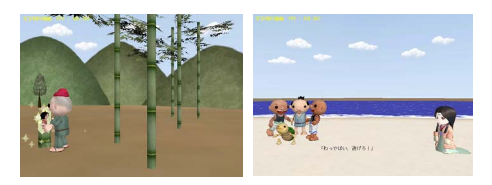
Fig. 6. Examples of scenes in the system

basic functions, we will develop the second prototype where story would change depending on the interaction between users and the system.