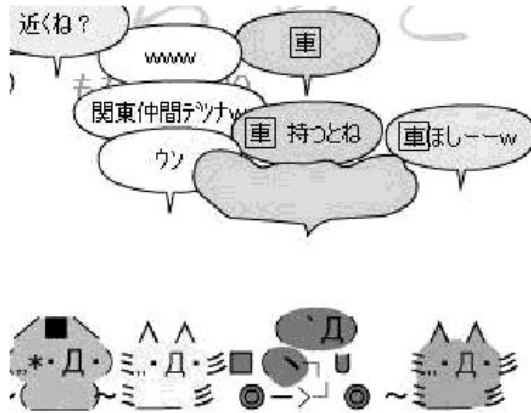
Fig. 1. A screen shot of an avatar chat where word co-occurrence is seen

based on input features extracted by singular value decomposition (SVD) from their co-occurrence in each slot. Due to not considering discussion topics, the approach has arguably low performance in discovering conversation chatter pairs, as shown in [4], when multiple discussions are on-going concurrently by many chatter groups.