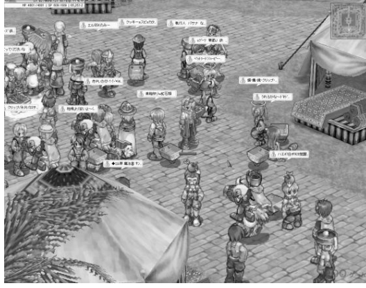
Fig. 2. A screen shot of Ragnarok Online used in the experiment