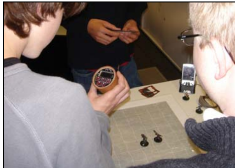
Fig 1. A pervasive tabletop game with the Smart Dice Cup being in use

Dice are crucially important components of a wide range of games. They are used for creating variations in the game flow. By rolling dice, an element of chance is introduced to an otherwise static and deterministic flow of game actions. The chance in the dice, however, is not equal to the generation of a random number. Rolling dice involves both a physical act and skill (some people and some dice roll better results than others) as well as a social mechanism to supervise and control the physical act, because cheating is a common phenomenon associated with this particular way of adding variability to games. Hence, rolling dice is a very interesting example of a gaming interface that is particularly suitable for a computer augmented realization.