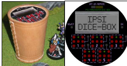
Fig 2. The user interface of the Smart Dice Cup

Each of the five dice displayed on the surface of the dice cup consists of seven red LEDs that represent the spots of the respective die. Whenever the device is shaken, the respective light patterns change in accordance to the tossed result. A small green LED is used to indicate whether the respective die is held or released, i.e. if its face changes when the device is shaken. To toggle between holding and releasing a die, a small button is associated with each die that turns the respective green LED on or off with each press, thus ensuring an intuitive way of changing the individual held states by providing visual feedback and adhering to the Gestalt law of proximity regarding the button layout.