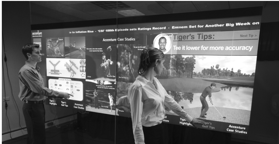
Figure 4. One example of an interactive advertising and entertainment application.