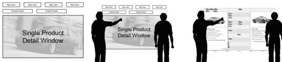
Figure 1. Layouts in different form factors.

In Figure 1 (adapted from content at [6]), we show three possible software environments. The left panel of Figure 1 depicts a number of buttons arranged along the top of a screen. One of the buttons has been selected, causing a product detail window to appear below. The scheme is typical of what we might find in a Macromedia Flash application on a website. Note that the menu system takes up the whole width of the application environment. This reveals one kind of modality assumption: it assumes exclusive rights to the entire upper edge of the (single-use) viewing port. The product detail window takes up the rest of the space, again modally, covering up whatever might have previously occupied that real estate. This kind of logic works well in a single-user environment with a small screen, because it uses the limited screen real estate effectively.