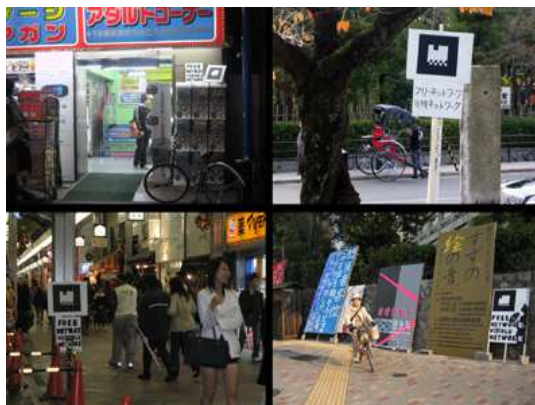
Fig. 2. Markers indicating Free Network access around the city.

ToolKit is used to develop the tracking part of the system, and the Internet traffic data captured by the CarnivorePE program are used for determining the different attributes of the virtual objects (the type, size, color, etc.)