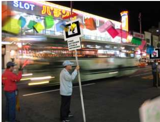
Fig. 1. Screenshot of our system running besides one busy street in Kyoto

obvious and that exists beneath the surface of what we usually perceive [2]. Our project is also related conceptually and formally with other initiatives as the “warchalking” [3], a term developed by Matt Jones that refers to the act in which people walk through the cities in search of WiFi nodes, and leaves a simple chalk drawing for others to find it without difficulty. In which is referred to the representation of invisible meanings in the real space, our project has also some relations with Remain in Light , a piece of the Japanese artist Haruki Nishijima [4].