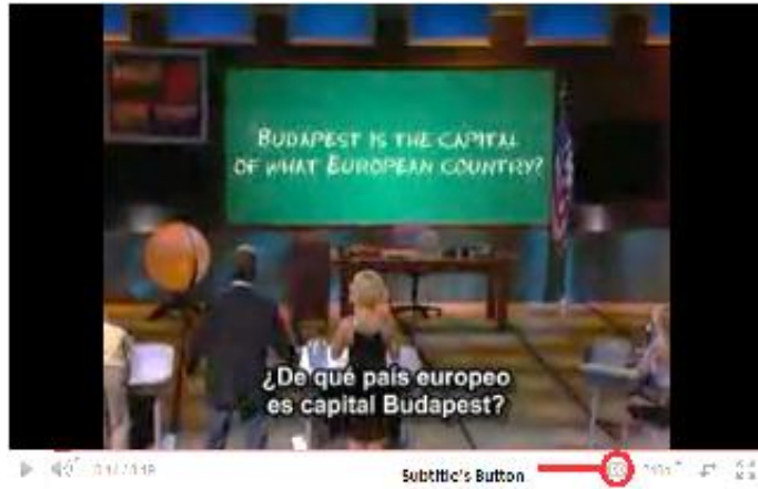
Figure 2 YouTube's screenshot that shows CC button.