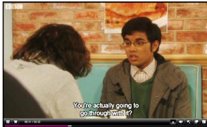
Figure 1 BBC iPlayer's screenshot showing subtitles.