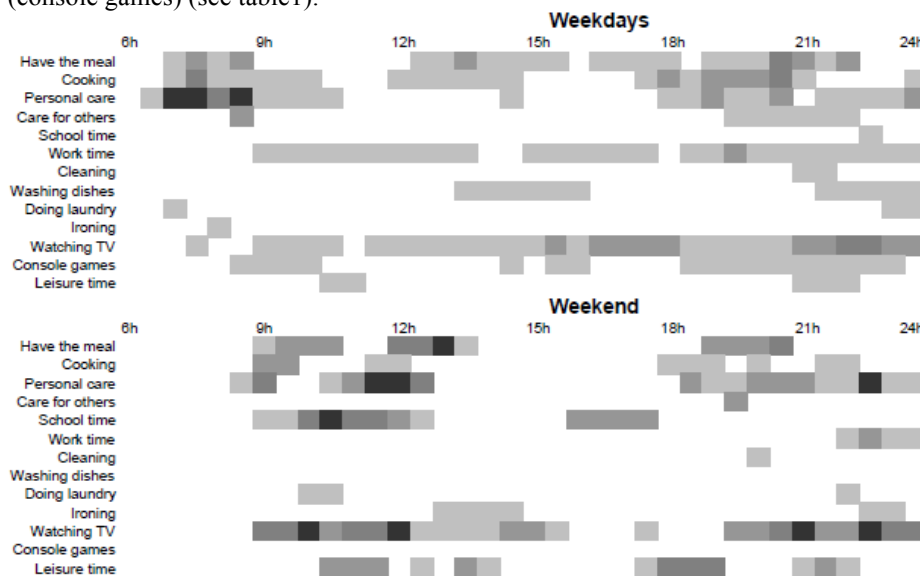
Fig. 2. Distribution of family activities over time during weekdays and weekends.

constantly switches on the TV whenever he walks around the house, even if he's not there watching, in the kitchen, in the bedroom, in the living room..." (family 7, Mother, ref3). The powermeter gave family members the ability to support their arguments with data, as in one case where children complained about the fathers' use of his personal computer in response to his criticism on their use of console games. In other cases, family members used energy cues to infer behavior, such as when parents observed that their children spent too much time with console games, or the presence of the maid: "on Mondays the maid comes and vacuums, cleans, irons as we checked in the computer [powermeter] that day is an energy peak for us" (family 28, Father, ref1). In fact, family members rated activities higher in terms of energy consumption when these meant using high perceived consuming devices (cooking, and laundry) or when they would spend a considerable amount of time performing these activities (console games) (see table1).