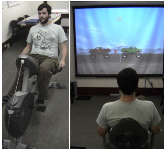
Figure 4. Equipment setup. Left: player pedaling on bike; Right: player's view of the game.

The study was designed to investigate the effectiveness of haptic feedback in exergames, not the long-term exercise efficacy of the games. Therefore, each trial was short, lasting between 1 and 5 minutes. Participants were given time between each trial to cool down and return to a resting state. Following the completion of all six trials, the two participants were brought back into one room for a post-experiment interview and debriefing.