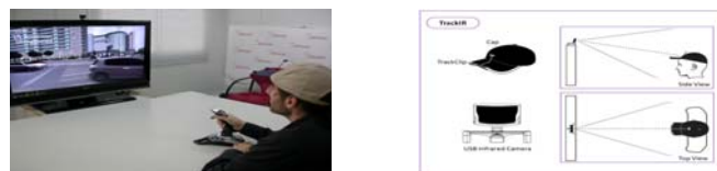
Figure 1. Overview of the VRSC and description of tracking system.