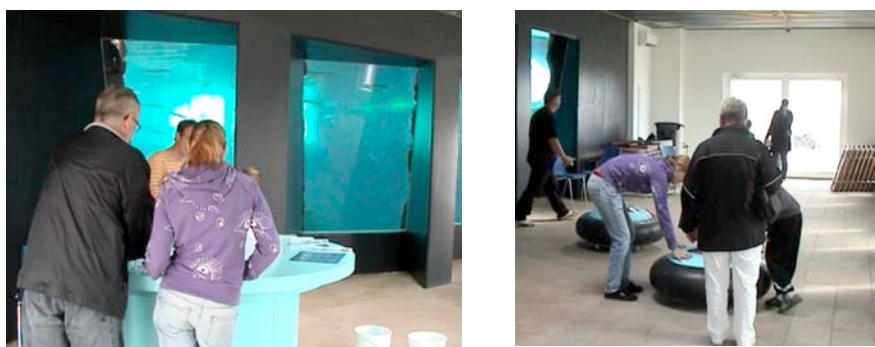
Fig. 4. (A) The girl creating fish with her father and (B) using the Hydrosopes with her brother.

There are several things worth noting, with regard to the elements of engagement described in the previous section. During the first part of the user's interaction (Fig. 3, A), the girl is using the construction table by herself, and goes back and forth between the Hydrosopes and the construction table every time she has constructed a fish. Finding her own fish in the Hydrosopes inspires her to create new fish, which in turn prompts her to explore the digital ocean through the Hydrosopes. After approximately ten minutes, the girl loses interest in the Hydrosopes, walks to the large window of the aquarium, and spends a few moments looking at the fish (Fig. 3, C). After having watched the aquarium for a few moments, the rest of her family enters the room, and her father begins to construct a fish at the construction table. The girl immediately joins her father, and they collaborate on building a new fish. As her father is apparently using the installation for the first time, on several occasions the girl instructs her father on how the installation works (Fig. 4, A). After a few moments, her attention turns to her mother and her younger brother, who are exploring the digital ocean through one of the Hydrosopes. She walks to the Hydrosopes, and spends time moving one of these around with her brother (Fig. 4, B), before returning to the large aquarium windows.