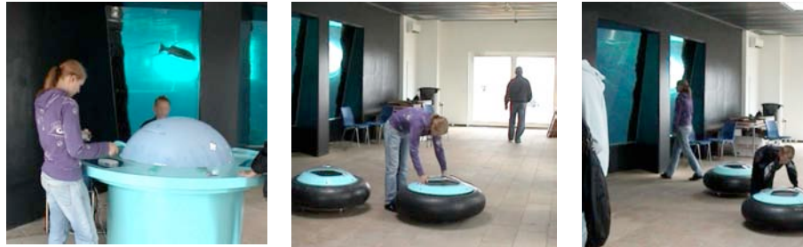
Fig. 3 (A) The girl moving between the construction table, (B) the Hydrosopes and (C) the large aquarium.

There are several things worth noting, with regard to the elements of engagement described in the previous section. During the first part of the user's interaction (Fig. 3, A), the girl is using the construction table by herself, and goes back and forth between the Hydrosopes and the construction table every time she has constructed a fish. Finding her own fish in the Hydrosopes inspires her to create new fish, which in turn prompts her to explore the digital ocean through the Hydrosopes. After approximately ten minutes, the girl loses interest in the Hydrosopes, walks to the large window of the aquarium, and spends a few moments looking at the fish (Fig. 3, C). After having watched the aquarium for a few moments, the rest of her family enters the room, and her father begins to construct a fish at the construction table. The girl immediately joins her father, and they collaborate on building a new fish. As her father is apparently using the installation for the first time, on several occasions the girl instructs her father on how the installation works (Fig. 4, A). After a few moments, her attention turns to her mother and her younger brother, who are exploring the digital ocean through one of the Hydrosopes. She walks to the Hydrosopes, and spends time moving one of these around with her brother (Fig. 4, B), before returning to the large aquarium windows.