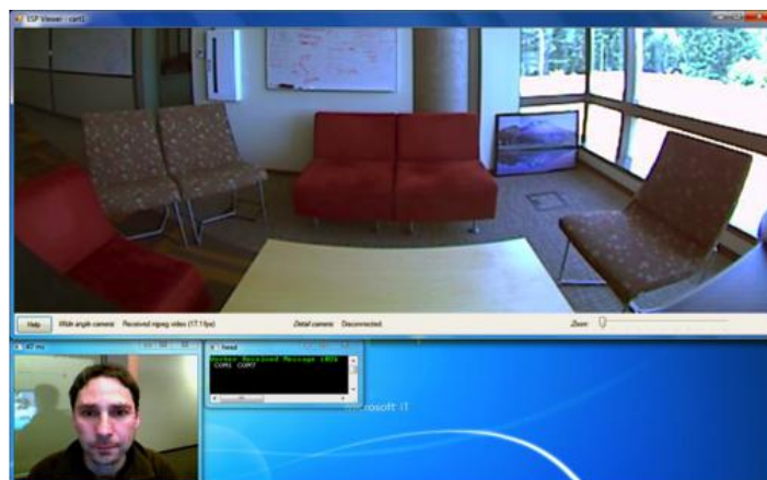
Fig. 3. View of the satellite’s interface. At the top is the view coming from the fixed wide-angle camera. The lower left window provides feedback of the image the satellite is projecting on his or her proxy. It also provides feedback that the head-tracker has a good representational model of the satellite’s head.

All audio and video communication was over wired and wireless LAN, while the position control stream for controlling the motion of the proxy was carried by USB cable between the two rooms.