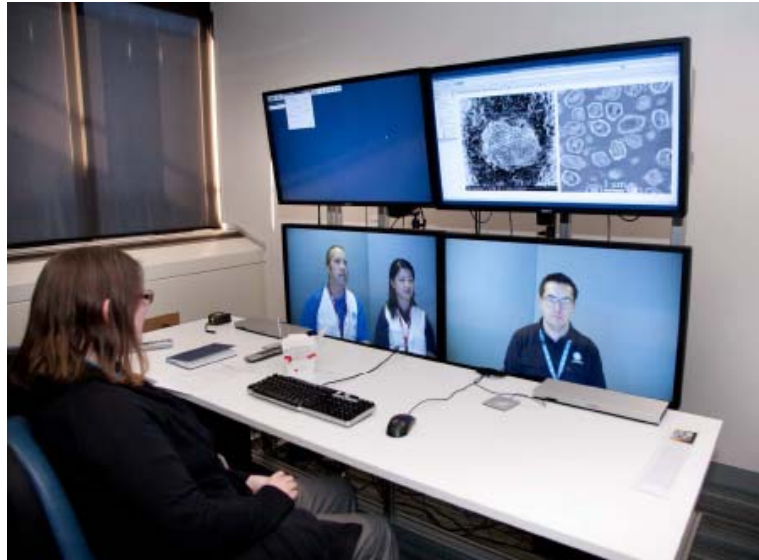
Figure 1 The integrated communication and collaboration platform at Australian Animal Health Laboratory (AAHL).

“shared workspace” was reviewed by three design representatives from AAHL and two experts from the national biosecurity authority. This feedback of the expert users were taken into account before the platform was finalised, developed and commissioned. After the introduction of the platform and training to the AAHL staff, a user study was conducted to capture the early adoption feedback from users (see section 5).