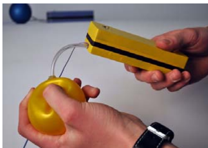
Fig. 3 The final prototype

Prototypes were created to validate certain design steps and later developed into a more experiential and advanced prototype, momentarily as a final design. Further investigations should be made to quantify the influence of the new product within a conversation. This would provide more insight for developments. In future, PU rubber material should be adopted, as it would enhance the interaction with the ball. Furthermore, investigations should be made to know if people are more likely to use a desktop application when the ball device is introduced. At this point, it is essential to evaluate the prototype with an aphasia therapist/expert to gain contextual insight; afterwards, a user test with actual users like aphasics may commence. An initial test between a person with aphasia and his/her therapist should be done before trying out in more dynamic situations. The design concept developed in this paper can eventually serve as an intervention tool, which can be integrated into application interfaces already built for people with aphasia.