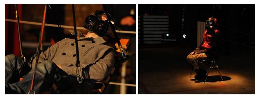
Figure 3 Left: Participant riding the swing whilst wearing the gas mask. Right: Participant in seat, waiting for next rider to mount

In addition to the unique form of interaction provided by the mechanism described above, the experience of taking part in Breathless is heightened by the structure and theming of the event, which together create an intense experience with a strong sense of immersion, but which still allowed for playful interaction between participants. To accentuate the atmosphere of the experience, the event took place after dark. We also used a wireless microphone attached into the gas mask to collect the sound of participants breathing, and used a powerful amplifier to fill the event space with this sound.