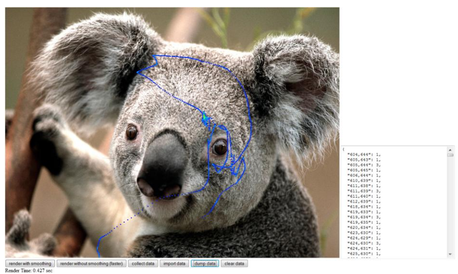
Fig. 2 Application for creating heatmaps from mouse input as well as from imported points

2. JavaScript application for creating heatmaps<sup>3</sup>. Created by Michael Dungan, released under the MIT license. This application creates heatmaps on images taking mouse movement as an input data (Fig. 2). However it has the functionality to import points, so we used it to generate heatmaps for our test. It takes as parameters the offset of the picture and a "mousemove mask" for smooth rendering, so we omitted this last parameter and put '3' as a default value (center). Additionally we needed to run the browser in full screen mode, so the coordinates of the points calculated in Opengazer .Net port application would be adequate.