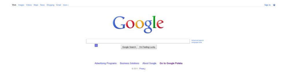
Fig. 3. Google.com website during the test, small blue square shows the position of the participants gaze.

The goal of our experiment was to try to perform remote usability eyetracking test and analyze if our method is suitable for future development. We tested it with five users, on different computers but with the same webcam (Logitech Quick Cam 9000). During the test, first thing that we did was to connect to user's computer via Skype and Remote VNC. After that we instructed the user how to position the camera and how to calibrate the eyetracking application. This was the toughest part for all the users, because the calibration process in this application requires a lot of patience. Application sometimes crashes, and calibration often needs to be repeated few times until it is correctly set. When the results of calibration were satisfactory we asked our user to start CamStudio and perform some simple actions on google.com web page, such as to log in. While user was working with the page we were able to see where he is looking, because small blue square was showing that position (Fig. 3). It is a very helpful thing for the moderator, because he can observe at which elements the user is looking during the test and have more control over what user is doing.