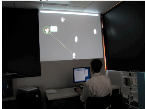
Figure 3. A user seated in front of an OMNI display, with four remote contacts. The user is focused on the leftmost contact, as indicated by the line.

appear next to Alex's avatar on Bill's display. If Bill continues to look at this information, (i.e., as Bill's focus level on Alex increases), Bill's avatar on Alex's display moves toward Alex. Alex knows that Bill has noticed him, and can watch his display to see if Bill continues to attend to him. With sustained attention, they could opt to start a conversation or simply be aware of each other's interest.