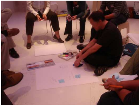
Figure 2a. B1 in charge of creating the concept map

writing their notes on the wall (figure 2b). There was some negotiation between the members of each sub-group about the written content but the members did not take turns in the writing. A similar situation was observed in Group B where one person took charge of making a concept map during the whole session and where no turn-taking occurred (figure 2a). A pattern of parallel work was also observed in Group D where four members worked largely by themselves to type in text and create nodes (figure 2c). Even though three of them stepped back to enable the other group members to have a go, only one out of the five remaining members took the opportunity to do so. It appears that in contrast to Group A, these three groups adopted a way of working that is more commonly observed in “whiteboard interaction scenarios” 2 .