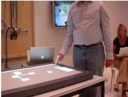
Figure 3a. D1 typing on the tabletop while the rest of the group is discussing.

It was also noted how the gatekeepers in Groups B and D maintained that role in the report back session to the rest of the workshop. Hence, their role of gatekeeper was able to be preserved, transferred and extended beyond the physical or digital manipulation of the tools.