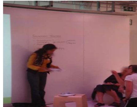
Figure 2b. The wall used as a big whiteboard