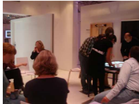
Figure 3b. D1 leaning towards the tabletop.