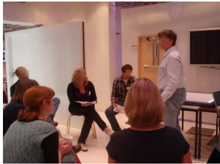
Figure 1b Group D sitting next to the tabletop