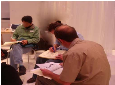
Figure 1a. Writing on the big post-it notes.

For Group D, a simple interactive concept map was developed for use in conjunction with the tabletop surface. The participants were instructed on how use it by the person who had designed the concept map software (D1). He explained how to create nodes, type text and build up a concept map. It was observed that the group chose not to sit around the tabletop at the beginning (see figure 1b); instead, they approached the tabletop later on only after they were explicitly asked by D1 to do so. Hence, similar to Group C, and in contrast with the familiar post-its and paper sheets, the participants appeared to be more reluctant in the beginning to use the tabletop concept map. It required scaffolding and encouragement by the software developer. D1 then took a screen shot of the resultant concept map and projected it onto the wall during the subsequent feedback session.