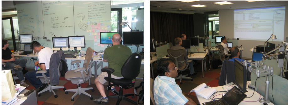
Fig. 1. Shared team rooms for the two software teams we observed.