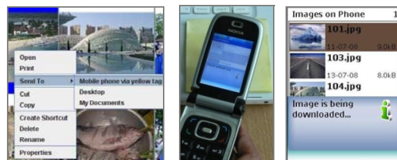
Fig. 1. Downloading a picture from the laptop to the mobile phone with Touch & Connect: select the appropriate option for a picture and touch the tag on the laptop with the phone.

For this prototype, an NFC tag is attached to the laptop's armrest and stores the laptop's Bluetooth MAC address which is then used to avoid the time required for searching available Bluetooth devices. Subsequent connections to the NFC tag are then used to initiate actual data transfers between the devices. This also eliminates problems concerning searching for previously paired devices as the device names can be ambiguous. Using the NFC tag when transferring data, the user can directly specify the target device which can be automatically inferred by the application.