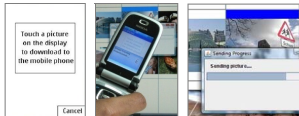
Fig. 3. Downloading a picture from the laptop to the mobile phone with Touch & Select.

The picture browsing application has been implemented in such a way that each photo item corresponds in its position to a tag in the back of the display. Even though this mapping suggests itself for this application, we argue that this is also possible for other types of applications based on sharing of information. With smaller tags coming on the market, the grid granularity can be increased such that a more precise location of the phone can be tracked. To upload a picture with Touch & Select, the user first selects it on the phone and chooses upload. The mobile phone then informs the user that an empty square on the display can be touched in order to upload the image. When a user touches the display, the corresponding picture is uploaded and shown on the screen of the laptop. The advantage of this method, besides being able to quickly transfer the file, is that a concrete location (or potentially application) can directly be