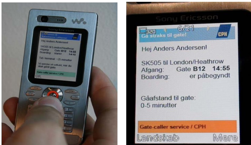
Fig. 3. The basic Gatecaller system informing passengers on when to go to gate, dependent on their current location. The picture to the right shows the message sent automatically when boarding has started to a passenger who has not yet shown up at the gate.

The design purpose of SPOPOS Gatecaller service is to reduce uncertainty that passengers experience and make them less liable to miss their flight. Airport operators will have fewer departures delayed due to missing passengers and, in the long run, more relaxed and satisfied passengers.