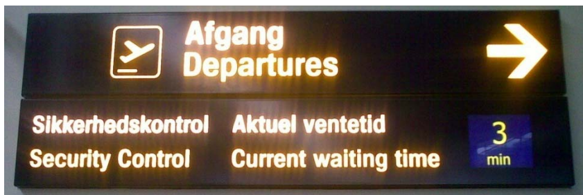
Fig. 2. Tracking of Bluetooth mobile phones provides real-time information to passengers and security managers on waiting time. The information is also published at the airport's webpage.

Increased security levels in airports increase the time passengers spend waiting for inspection and passport control. A queue can build up suddenly, and some passengers may become critically late while waiting in line. The SPOPOS tracking facilities make it possible for airport management to see passenger flow and congestions in real-time, and therefore, e.g., if and when a queue is accumulating at a particular control point. In turn, this overview provides airport staff with an option to increase the manning on the control point immediately (Figure 2).