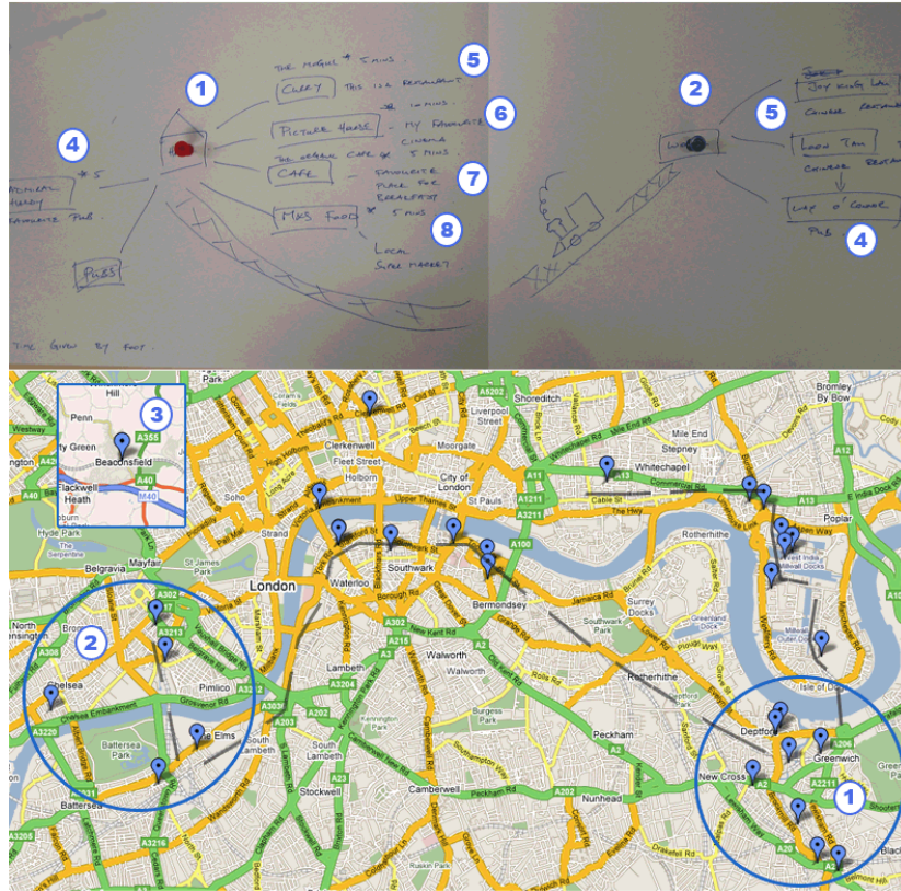
Fig. 2. Upper half: An example of a participant's sketch about his regular routes. Lower half: the related location tracking data. The markers represent approximate search locations. Multiple queries from one location are presented as one marker: (1) home area, (2) work area, (3) weekend holiday out of town, (4) pubs, (5) curry restaurant, (6) picture house cinema, (7) cafe, (8) supermarket. The dashed lines connecting areas (1) and (2) are the participant's daily train route.