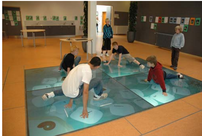
Figure 1: iGameFloor in use at school

iGameFloor supports three types of applications. Collaborative learning games . The kids work together through direct communication and kinesthetic interaction on the shared surface. The collaborative presence provides the social qualities of e.g. traditional board and card games. Knowledge sharing applications . A central placement of the iGameFloor in a department square makes it ideal for creating awareness of activities among classes. The floor is a remarkable [23] interface that draws attention to displayed information and encourage exploration. Simulations . The iGameFloor surface is ideal for simulating scenarios in a scale that immerses the kids beyond traditional computer displays. Learning about geometrics, physics, geography, and biology involves many examples of scenarios where there are learning potentials in simulations that may scale the content, simulating the users to be, e.g. nano particle size or stellar size.