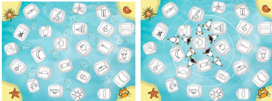
Figure 5: Various stages in a Stepstone application