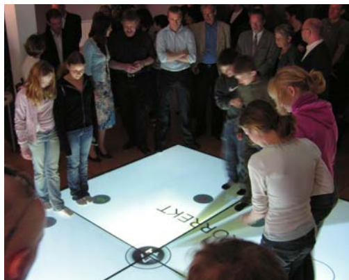
Figure 4: iFloorQuest in use with 8 players

the right answer - running the risk of missing ones own next question. As shown in Figure 4, children sometimes team up 2 in each corner holding on to each other to make joint jumps to the answer spots. This way kinesthetic interaction has introduced engaging physical activity on top of a traditional sit down quest game.