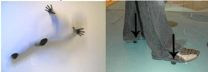
Figure 3: Limb contact with the surface is tracked. The black dots to the right show the estimated positions of the users' limbs that are used in the applications.

changes in the environment. To achieve this we use indirect light on the floor since the reflection from direct light can be disturbing for the users.