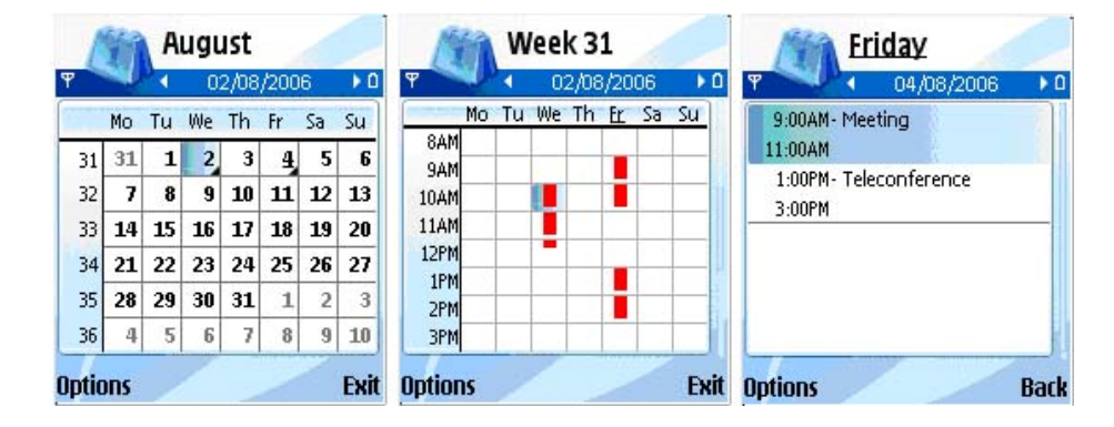
Fig. 1. Basic views in the calendar: month, week, and day views

We copied the basic functionality of the mobile calendar to our prototype in order to maintain consistency with the normal calendar application. Users can create calendar entries and reminders, as well as browse calendar content using month, week, or day views (Fig. 1). The application notifies the user with an alarm when an important event is due in the calendar.