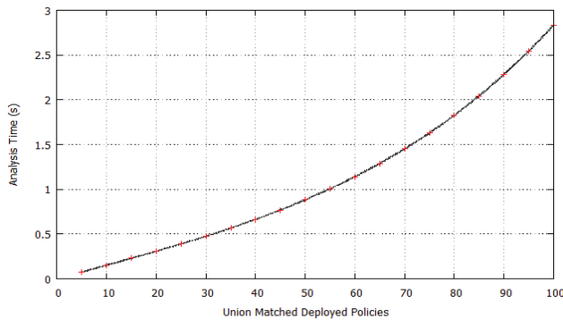
Fig. 2. Multiple Union Match Experimental Results

deployed for a large organization where individuals already have access control policies defined for them, and a new group policy is being deployed. The results will show how the number of individual workers can have an impact on the algorithm. For one such experiment, a single candidate policy element set was input into the algorithm. The number of matched deployed policy element sets would need to be considered in union to cover the candidate policy element set for this experiment.