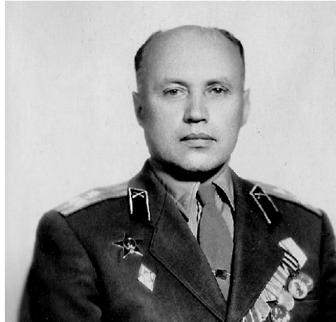
Fig. 1. Colonel Anatoly Kitov, scientific head of Computer Centre № 1 of the USSR Ministry of Defense (1959).

programmers, 85 information analysts, 40 mathematicians (specialists in mathematical modeling), several hundreds specialists in computer engineering worked on specialized and universal computer projects.