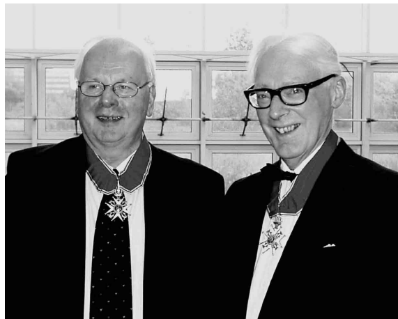
Kristen Nygaard and Ole-Johan Dahl in 2000, proud receivers of recognition from the King of Norway

The major chords of Nygaard’s life’s work are solidarity and empowerment. In his work on computer languages, system development, and object-oriented education, as well as in his work for the homeless, the trade unions, the environment, and the “Nei til EU” movement, he took the side