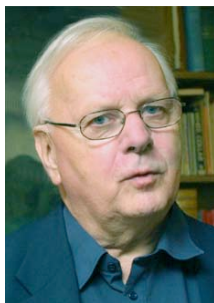
Kristen Nygaard in the mid-1990s

Many people are characterized as great. What constitutes great people? There is no simple answer. How do you measure greatness? Was Professor Kristen Nygaard (1926-2002) a great man? Maybe not, but in our view Nygaard set a high standard against which you can measure other people's greatness.